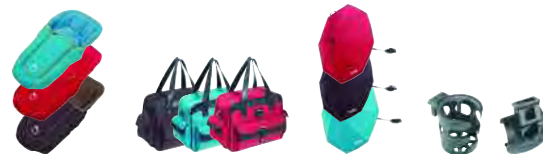
From left to right; 1. Upper and lower luxury fleece footmuffs 2. Large changing bag 3. Sun parasol 4. Cup holder 5. Parasol/cupholder clamp