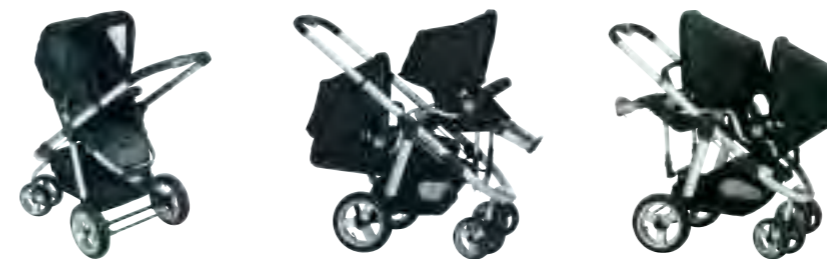
Older younger modes - from left to right; 1. Single rearward facing seat unit 2. Forward facing seat unit and lower carrycot 3. Rearward facing seat units