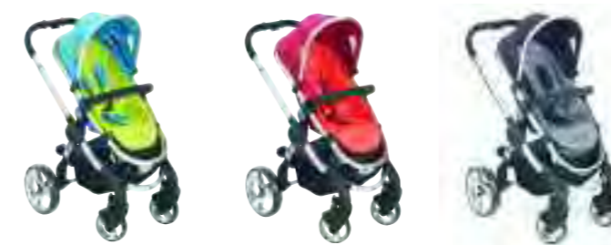
From left to right; 1. Sweet Pea 2. Tomato 3. Black Jack