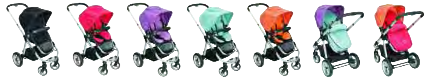
From left to right; 1. Blackcurrant 2. Redcurrant 3. Grape 4. Imperial 5. Mandarin 6. Grape with Imperial Footmuff 7. Mandarin with Redcurrant Footmuff