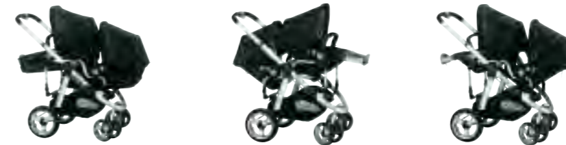
Twin modes - from left to right; 1. Twin carrycots 2. Twin forward facing seat units 3. Twin rearward facing seat units