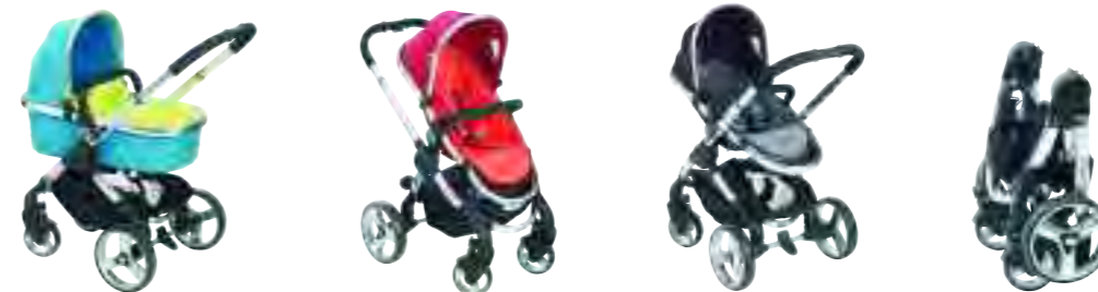
Single modes - from left to right; 1. Carrycot 2. Forward facing seat unit 3. Rearward facing seat unit 4. Folded chassis