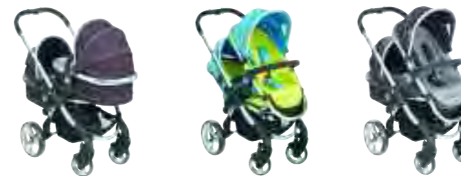
Twin and Blossom modes - from left to right; 1. Twin carrycots 2. Twin forward facing seat units 3. Lower carrycot and forward facing seat unit