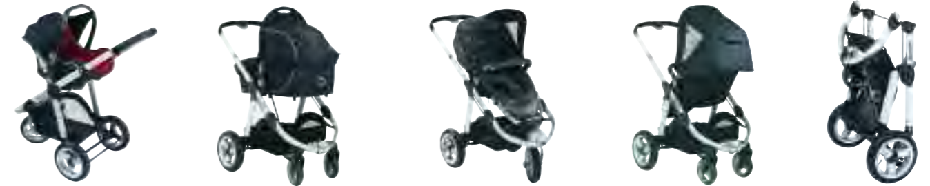
From left to right; 1. Jogger mode; Infant carrier car seat 2. 4 wheel mode; carrycot 3. Jogger mode; forward facing seat unit 4. 4 wheel mode; rearward facing seat unit 5. 4 wheel mode; folded chassis