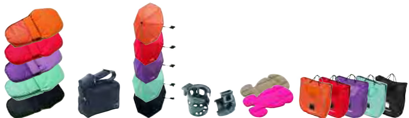
From left to right; 1. Luxury fleece footmuff available in the flavour colour options 2. Lifestyle changing bag 3. Sun parasol available in the flavour colour options 4. Cup holder 5. Parasol/cupholder clamp 6. Fleece core seat snuggle available in Beige and Pink 7. Flavour pack available in the flavour colour options