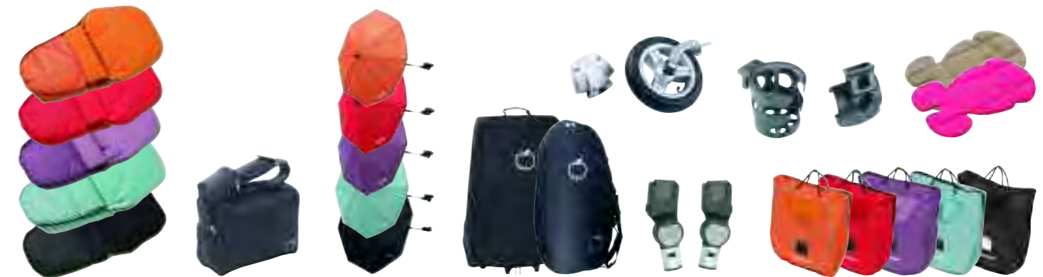
From left to right; 1. Luxury fleece footmuff 2. Lifestyle changing bag 3. Sun parasol 4. Travel bags 5. Jogger wheel 6. Infant carrier car seat adaptors 7. Cup holder 8. Parasol/cupholder clamp 9. Fleece core seat snuggle available in Beige and Pink 10. Flavour pack